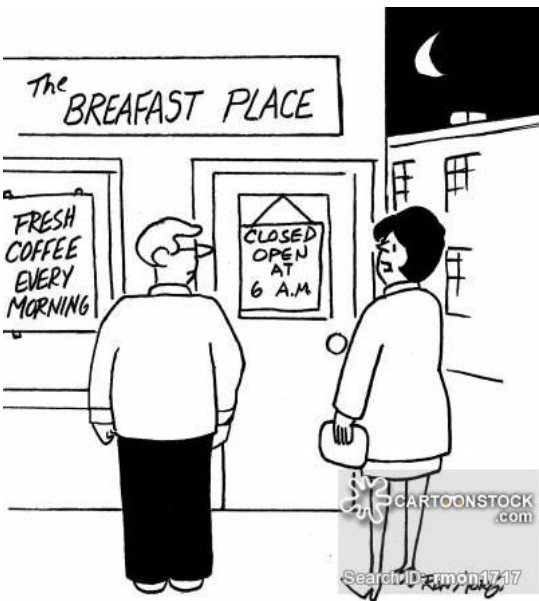
"You mean you also set our clocks back an hour?"

A video recording of the morning worship service will be posted to our church YouTube page either on Sunday or Monday. Here is the link to our YouTube page: https://www.youtube.com/channel/UCutET663hVzpPohBMiCXEQA