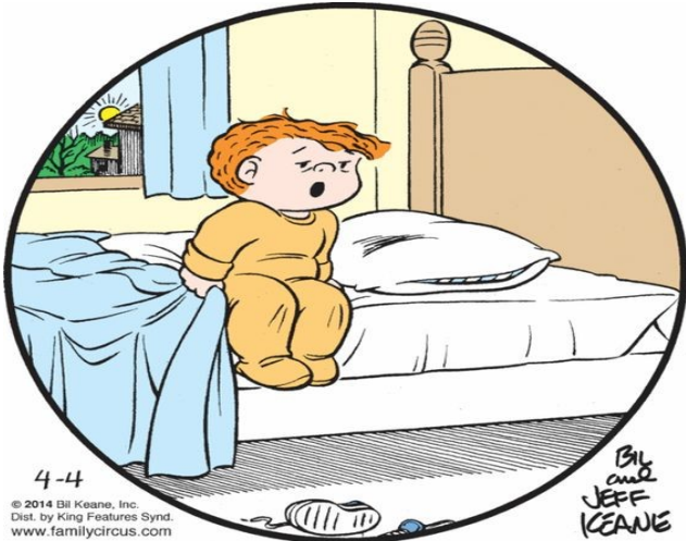
"I did rise, Mommy, but it's gonna be a while before I shine."