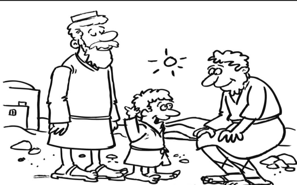
"And this is my dad. He begat me."