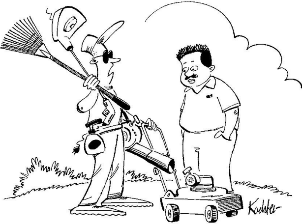
"I thought you invited me to be a Premises Keeper!"