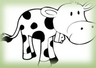
Snapshots at jasonlove.com