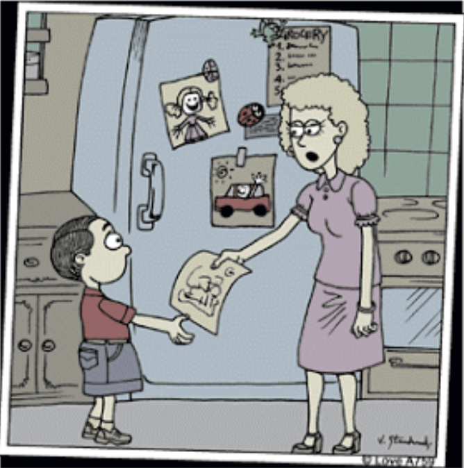
"It's good, Timmy, but it's not refrigerator good."