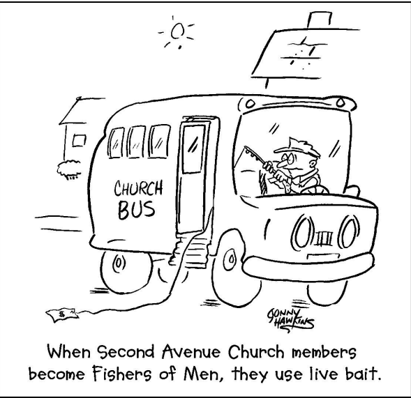
When Second Avenue Church members become Fishers of Men, they use live bait.

PRESCHOOL (Haven and KCES), YOUNG 5s, AND KINDERGARTEN REGISTRATIONS: We are enrolling now for the 2016-17 school year. If you have not received a registration form, stop in the office or get a registration online at kcsa.org , please return your form either to the Association Office or the Elementary Of-