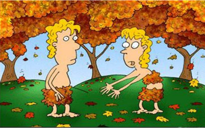
WILL YOU PLEASE PICK UP ALL YOUR CLOTHES?

Kalamazoo Christian High School Booster Club Annual Flower Sale: will be held on Saturday, May 6 from 10 am—2 pm. The sale will be held at Second Impressions. Annual flowers in flats and hanging baskets will be available. Mother’s Day is just around the corner on Sunday, May 14. The sale supports all sports at Kalamazoo Christian High School.