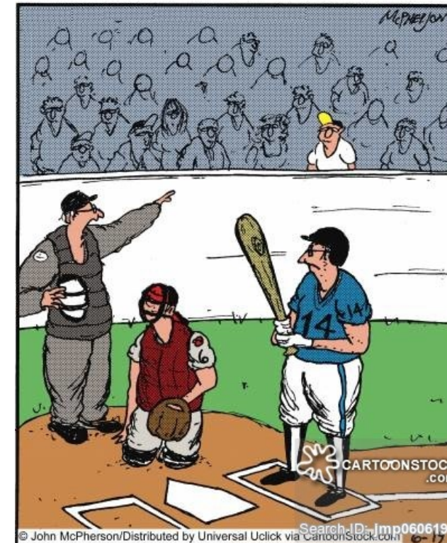
"Whoa! Time out. The loud guy in the white shirt is right — that was a ball. My mistake. Sorry everyone. Thank you, sir."

Spring Salad Luncheon: Everyone is invited to a Spring Salad Luncheon at Milwood Community Church (3306 Lovers Lane, Kalamazoo) on Thursday, May 2 from 11 am—1 pm. All you can eat of a huge variety of delicious homemade salads—donations will be appreciated. Kids 5 and under eat free. Proceeds benefit the Milwood Coffee Break Bible study program.